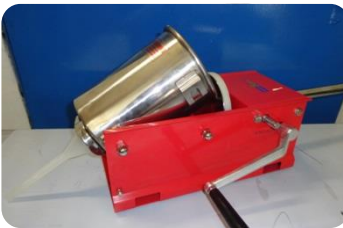
12lt Worspro sausage filler